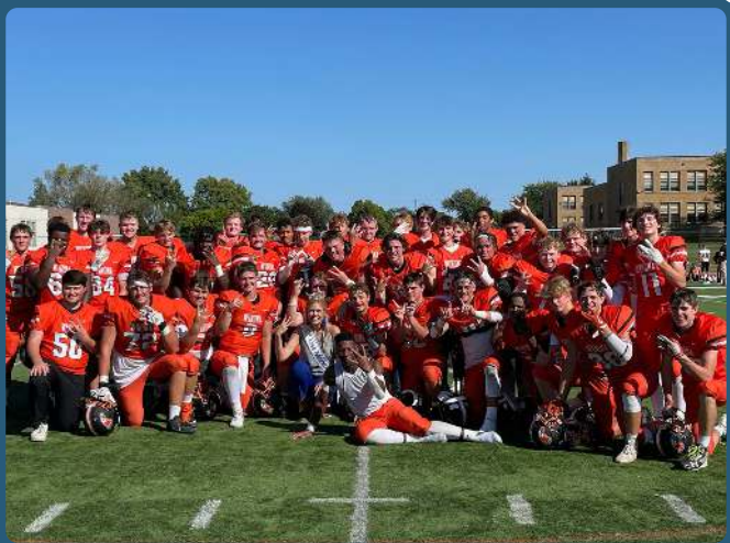
Miss Minnesota with WSHS Football Team