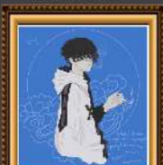
Olivia B. Cotter Schools