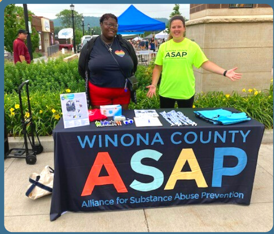
ASAP at the Winona Farmer's Market!

WINONA COUNTY ASAP Alliance for Substance Abuse Prevention