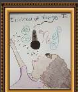
Emilia Krage Cotter Schools