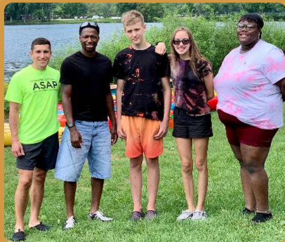
Some Paddle Challenge! participants