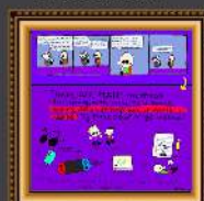
Spencer Suggs Cotter Schools